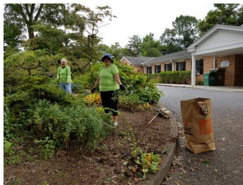
Club members weeded for hours at the New Cumberland Library on several different days