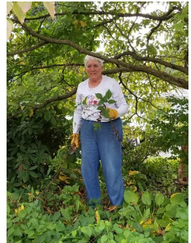
Getting after the poison ivy at the New Cumberland Library