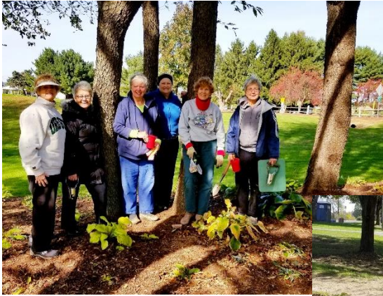
Planting bulbs at our hosta Garden in Adam Ricci Park on a sunny fall afternoon!