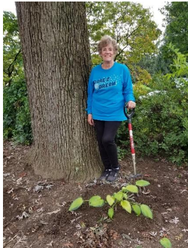
Planting hostas at the New Cumberland Library