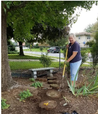
Placing a bench and a wood path in the Ruth Memorial garden at the New Cumberland Library